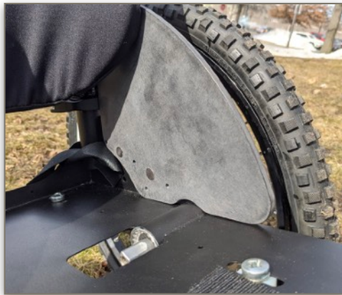
Shown with seat cushion removed.