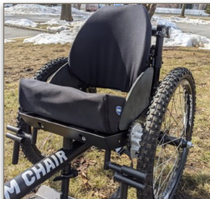
Finished look at installed Side Guards.