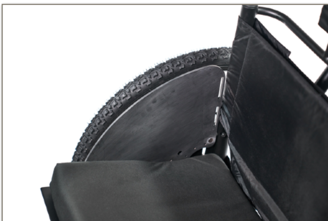
Figure 3: Finished look at an installed Side Guard.