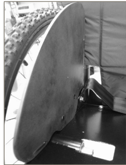
Figure 1: Shown without seat cushion.