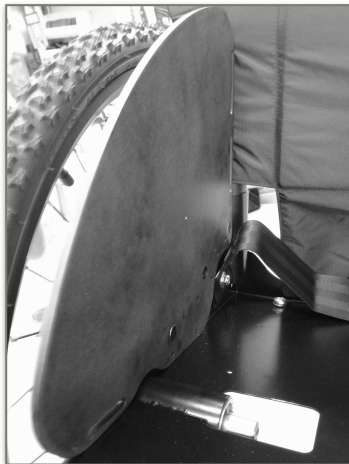
Shown with seat cushion removed.