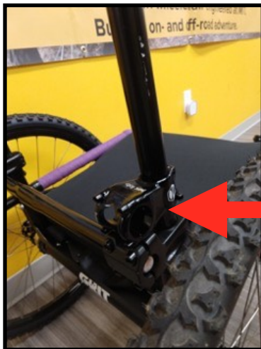
Trail Handle stem clamp

2) Use a 5mm Allen key to remove the seahorse clamps from the seatback canes.