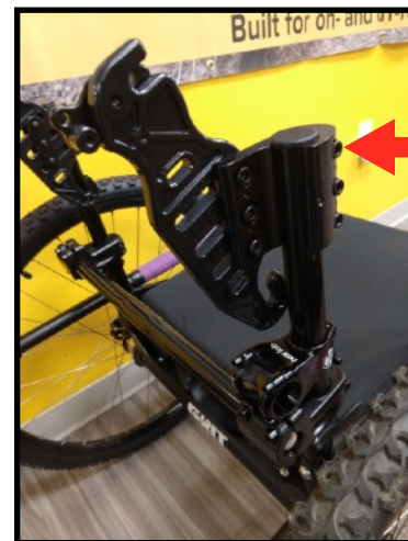
5mm Allen key bolts

3) Use a 4mm Allen key to open and then tighten the Trail Handle stem clamps onto the seatback canes.