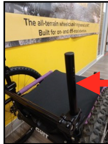
Seahorse clamps removed

1) Remove the seatback from the seahorse clamps.